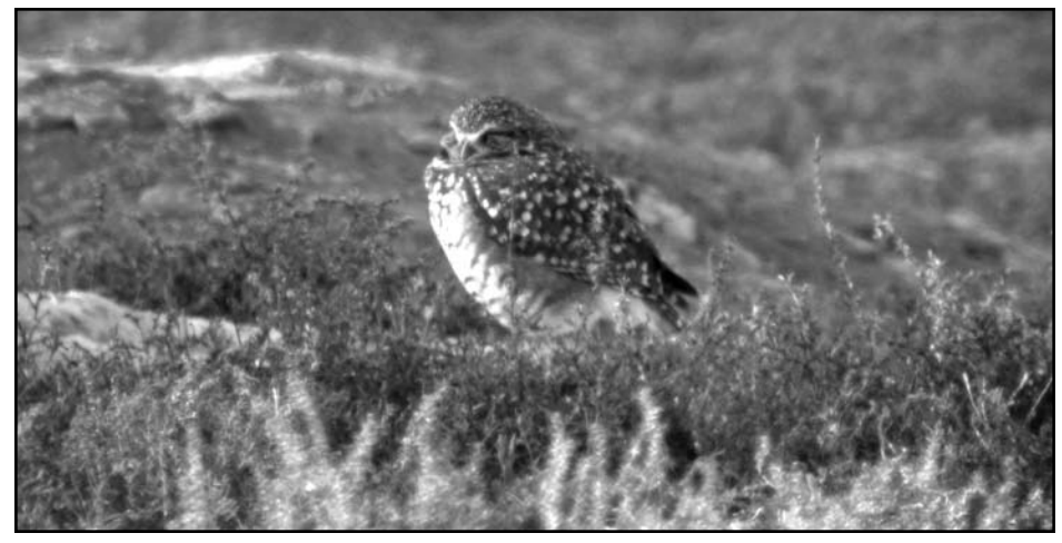
This snoozing Burrowing Owl was just one block from downtown Roswell