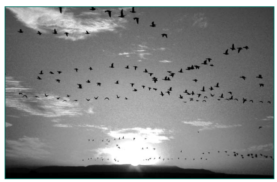
Snow geese at dawn over Bosque del Apache

Iain's June trip to Scotland is full but he will lead a 'North Country Weekend' at the Balsams, July 12-13, 2008. See page 7 for more information.